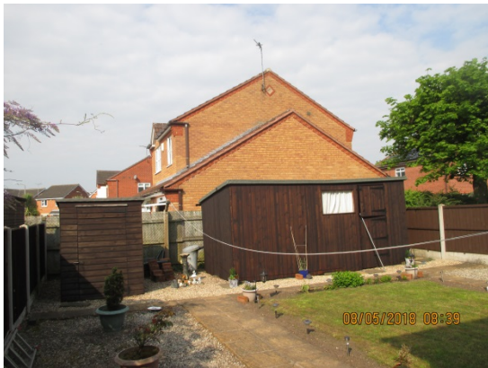
View from rear garden of no. 105 Haddon Crescent