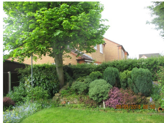
View from rear garden of no. 107 Haddon Crescent