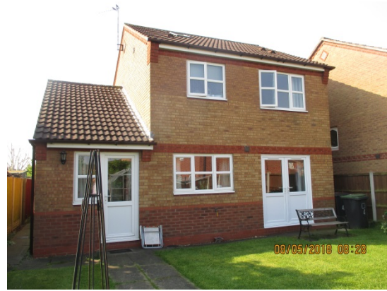
North (rear) elevation