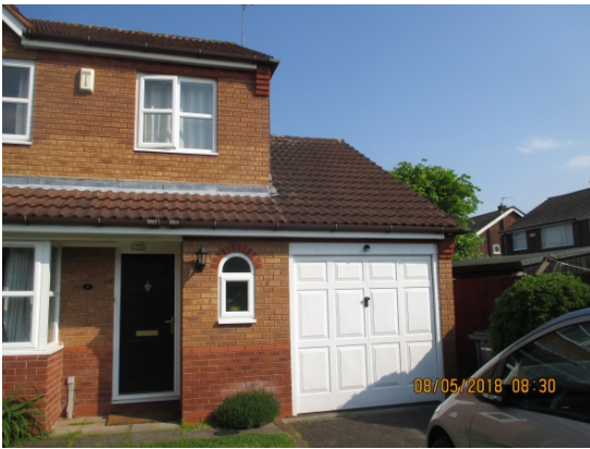
South (front) elevation